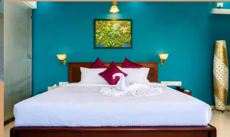
Sea View Suites