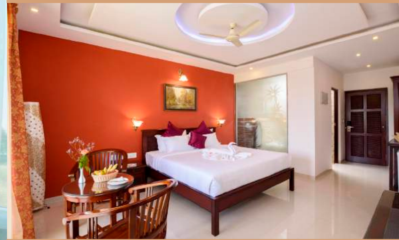
Delux Sea View Room